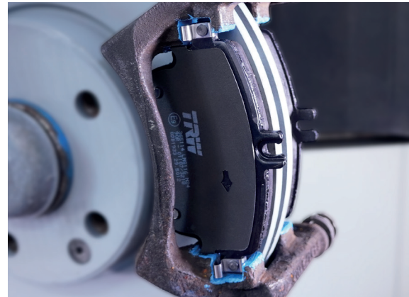
Quick and clean repair

Another outstanding feature of NOxidation is the simplification of the disassembly of the brake components during an upcoming repair. The special formulation of the grease prevents rusting of the parts, which considerably facilitates maintenance work and thus saves time. In addition, NOxidation is distinguished by a high thermal bandwidth. The grease remains stable and effective even at extreme temperatures, be it in cold winters when "curbside parking" or with continuous load on the brake.