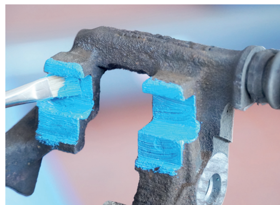
Pad guiding treated with NOxidation

NOxidation ensures effective lubrication of the pad guide. This is crucial to ensure that the brake pads move evenly and without resistance. A well-lubricated pad guide prevents unwanted pad contact with the brake disc when the brake is released and thus not only contributes to improved driving comfort, but also reduces wear on the other brake components.