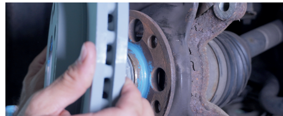
NOxidation for unhindered movement