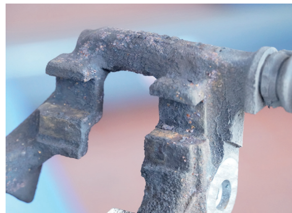
Corroded pad guidance

A significant advantage of NOxidation is the reliable protection against creeping corrosion. After all, corrosion is a problem that can lead to the brake components seizing and the resulting malfunctions, to vibrations and thus to noises during braking. Here, NOxidation forms a protective barrier that prevents the penetration of moisture and dirt and thus significantly extends the service life of the components.